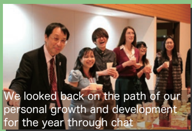
We looked back on the path of our personal growth and development for the year through chat