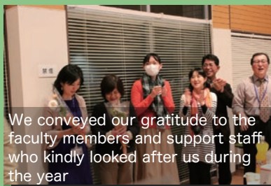
We conveyed our gratitude to the faculty members and support staff who kindly looked after us during the year

HBP's International Environment for Study and Research