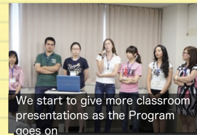
We start to give more classroom presentations as the Program goes on