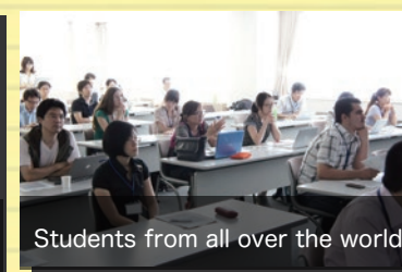
Students from all over the world