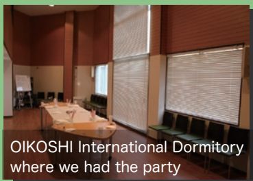
OIKOSHI International Dormitory where we had the party